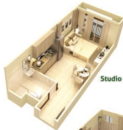
Studio Unit: 22 sqm ±