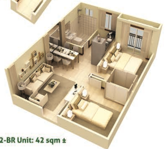
2-BR Unit: 42 sqm ±