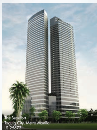
The Beaufort Taguig City, Metro Manila LS 25673