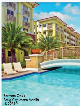
Sorrento Oasis Pasig City, Metro Manila LS 29310