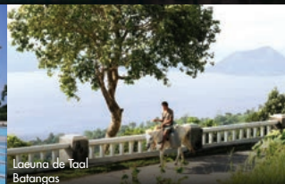
La Luna de Taal Batangas