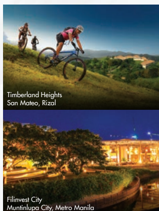
Timberland Heights San Mateo, Rizal