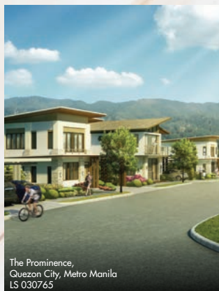
The Prominence Quezon City, Metro Manila LS 030765