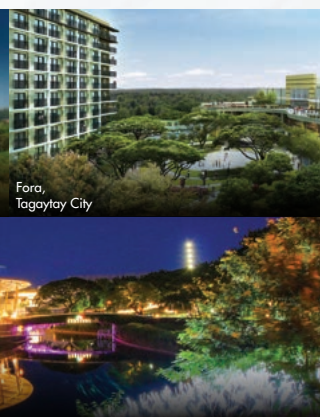
Fora, Tagaytay City