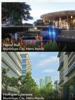
Festival Mall, Muntinlupa City, Metro Manila