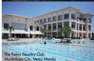
The Palms Country Club Muntinlupa City, Metro Manila