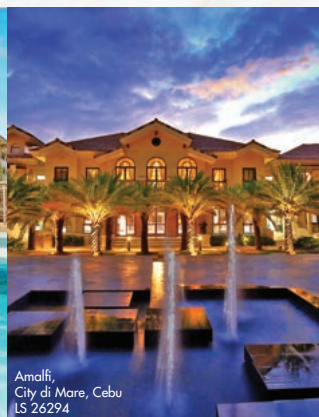
Amalfi, City of Mare, Cebu LS 26294