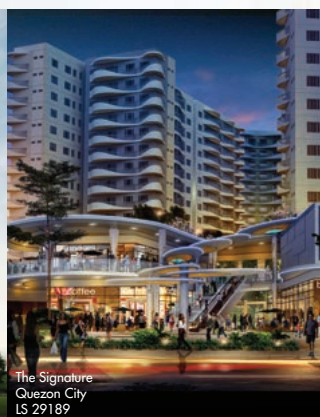
The Signature Quezon City LS 29189