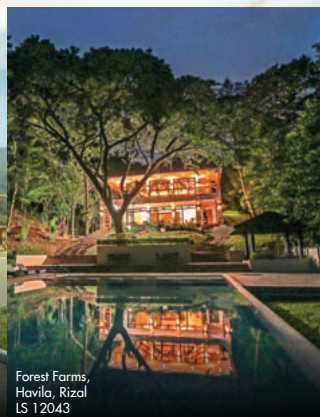
Forest Farms, Hailo, Rizal LS 12043