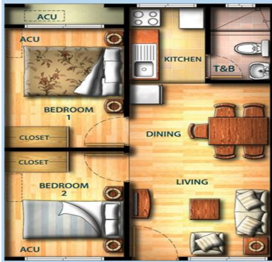
2-BEDROOM UNIT 38 sqm ±